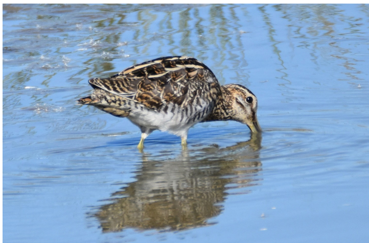
FIG. 1. SNIPE

If you are interested in the vegetation found in wetlands, it is best to visit these places in the late spring period, because it is the time of flowering most species of plants, which will make it easier to find and recognize them. If there is a pond or lake in these places, it is worth